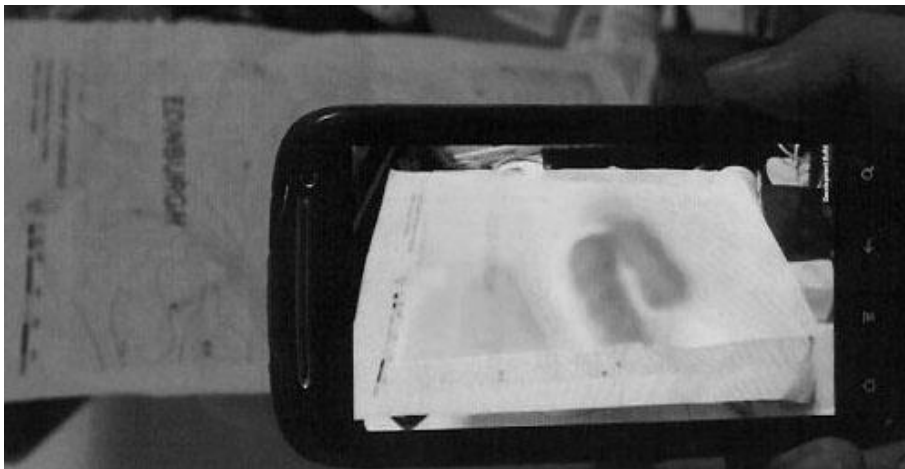
Fig. 2: Color-coded elevation map draped over AR terrain.

WANG & DUNSTON (2008) conducted a similar experiment in architecture where they asked students to compare mixed reality representations of underground pipes with regard to usability. Although they used a Head-Mounted Display HMD instead of a smartphone display, their basic research question is comparable and demonstrates that an experimental setup is a valid research design for this purpose. Our experiment was set up with four different treatments, all showing the same clip of the historic Edinburgh city center: a) a paper copy of the contour map as baseline, b) the paper map and an aerial photo draped over a virtual terrain model (Triangulated Irregular Network TIN) for augmentation, c) paper map and a color-coded TIN in AR (Fig. 2), d) paper map and contour lines on top of the TIN. It was assumed that any form of augmentation would receive a higher appeal than the paper map on its own. However, goal of the study is to discover which type of augmentation will be perceived as most appealing and which one as clearest.