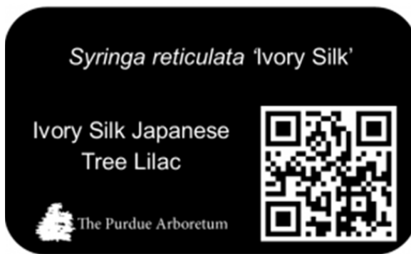
Fig. 1: An example of a P University Campus Arboretum QR sign

Plants around campus have integrated signs that list plant family, genus, and species along with a scannable QR code that links directly to that plant's page in the arboretum learning database. Each plants page includes information on flowering type and time, soil and growing conditions, general history, and seasonal imagery of the plant whenever possible. From each individual plant page, viewers can link to plants similar in genus, flowering type or season, or to pre-planned plant tours, all overlaid on a zoomable campus map.